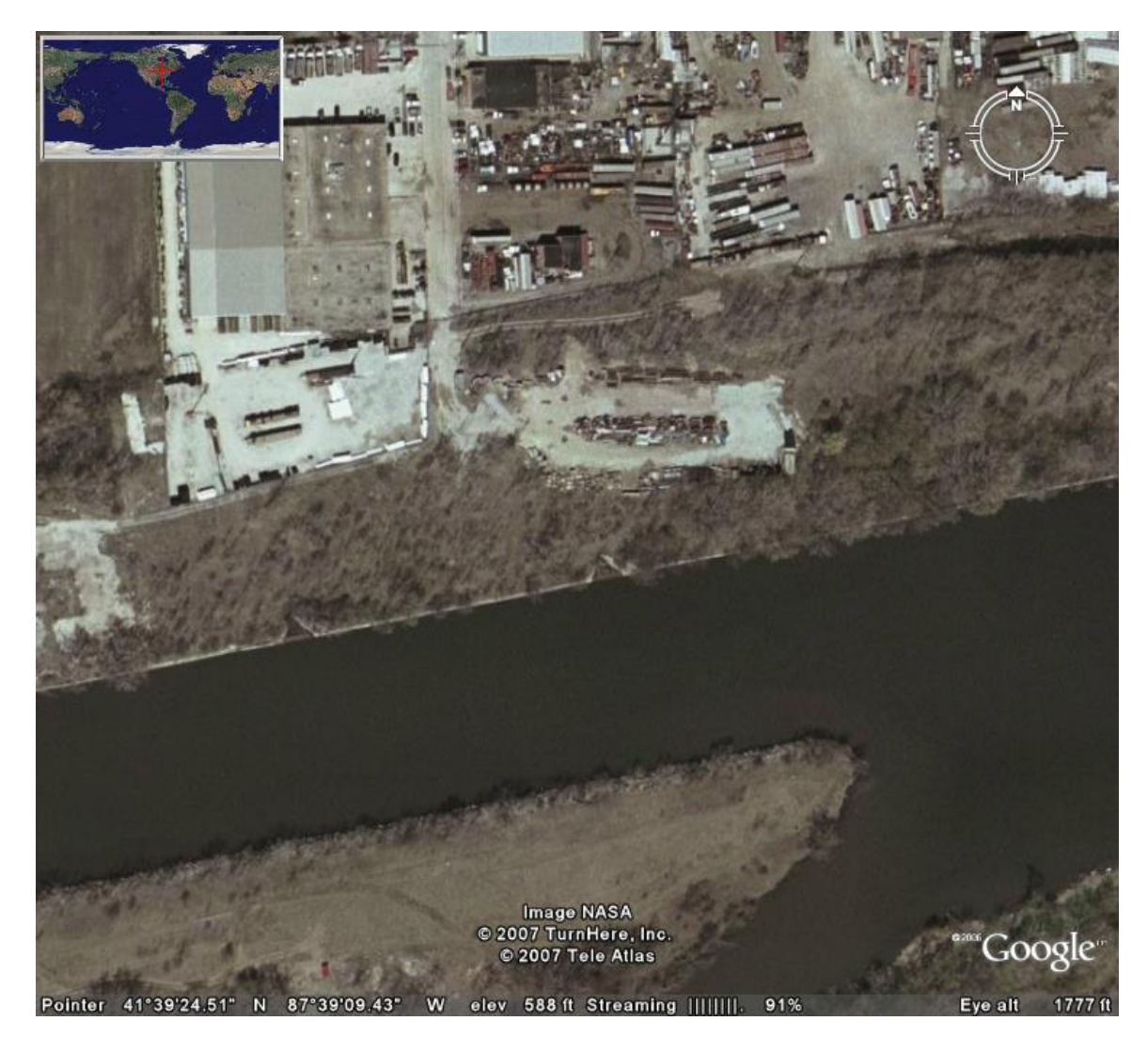
Former Blue Island Lock Calumet Sag Canal Blue Island, IL

The Little Calumet River flows from the lower edge to the right. The Calumet Sag Canal goes left to right. The north wall of the former lock with sector gate recesses is on the top edge of the canal.